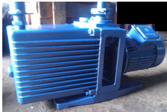
Direct Drive Vacuum Pumps