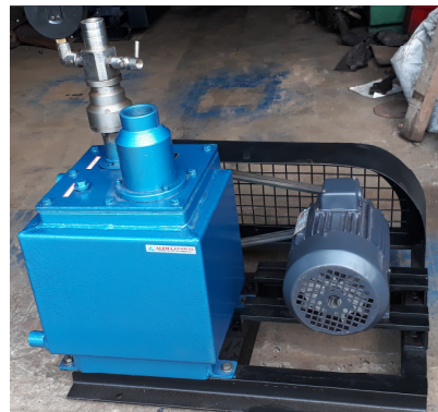
Oil Sealed Vacuum Pumps