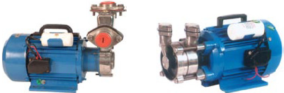
SIDE SUCTION / TOP SUCTION MONO BLOCK PUMP