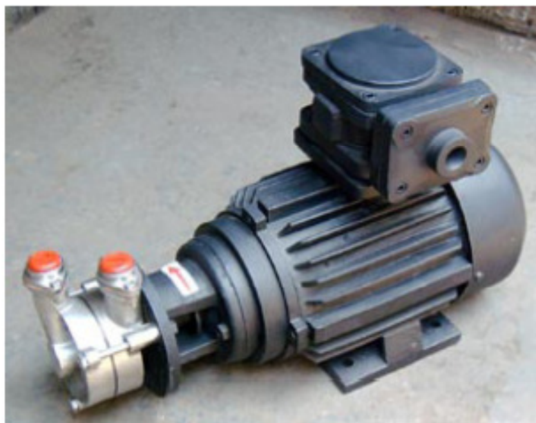
MODEL: ASP-0 WITH FLP MOTOR