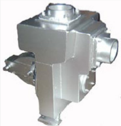
FABRICATED SS PUMP