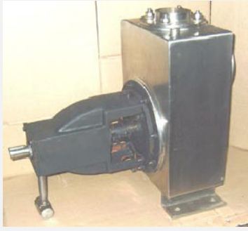
3" FABRICATED SS PUMP