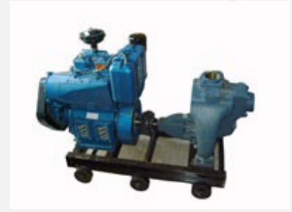
ENGINE DRIVEN TROLLEY MOUNTED PUMP