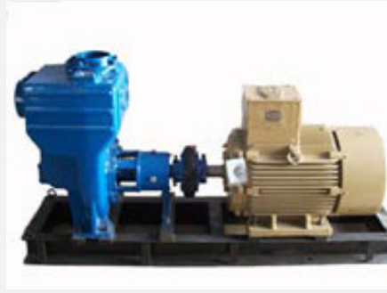
100 HP HIGH HEAD AND HIGH DISCHARGE MUD PUMP