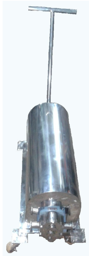
LOBE PUMP ON SS TROLLEY WITH CASTOR WHEELS