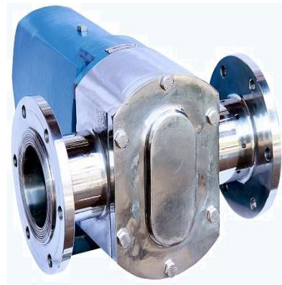
WITH FLANGE CONNECTION