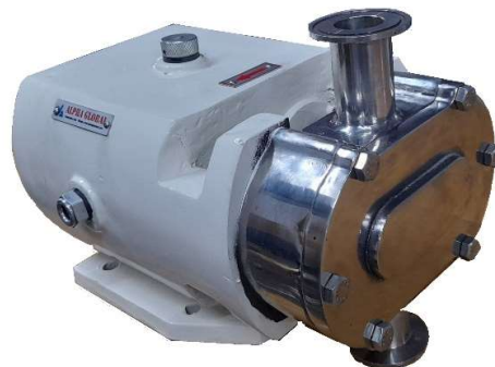
VERTICAL FLOW LINE TYPE