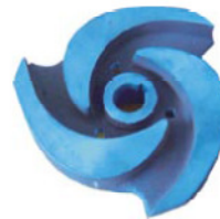
OPEN AND SEMI OPEN IMPELLER