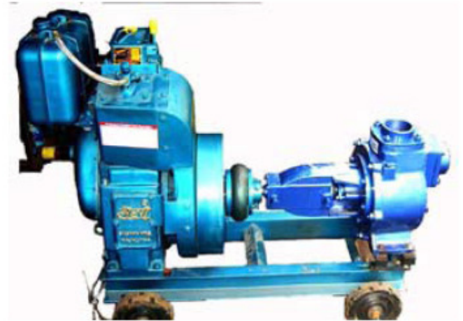
ENGINE DRIVEN PUMP