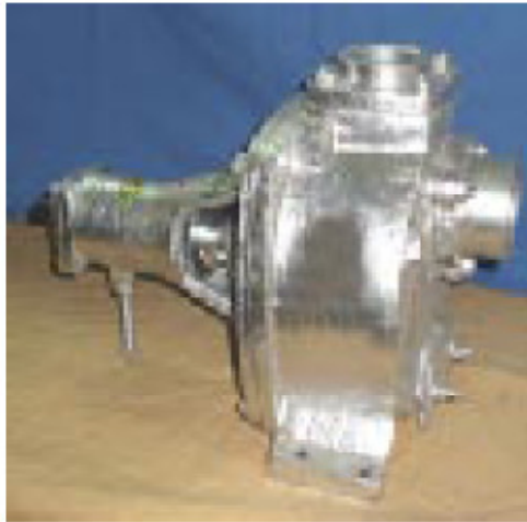
STAINLESS STEEL PUMP